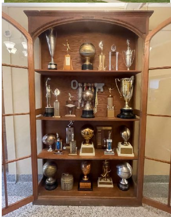
Trophy Case - Auditorium Entrance Hall