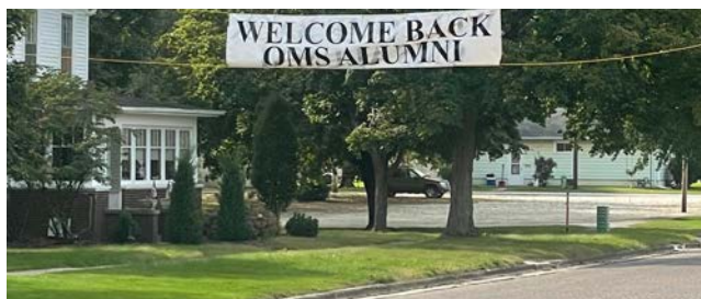
2022 OMSAA Reunion Picture