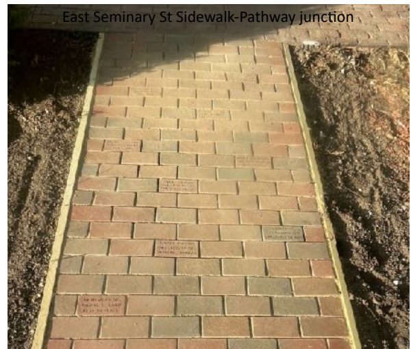
Initial ten engraved bricks installed