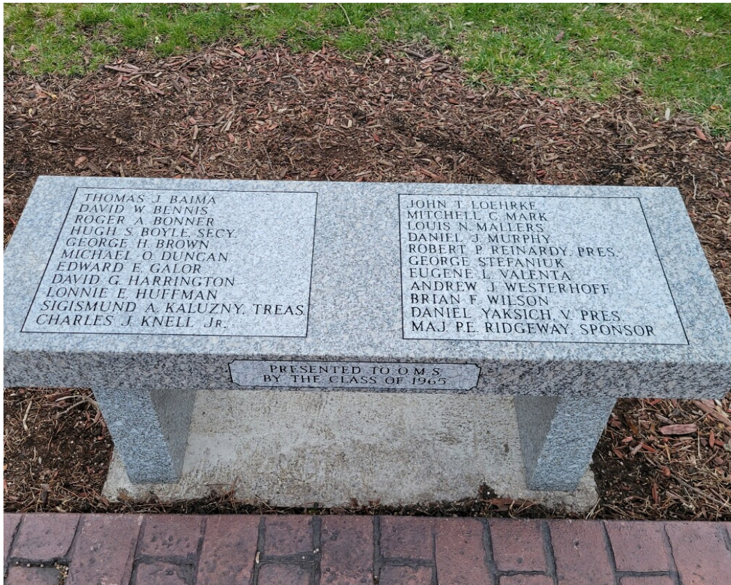
OMS CLASS OF 65