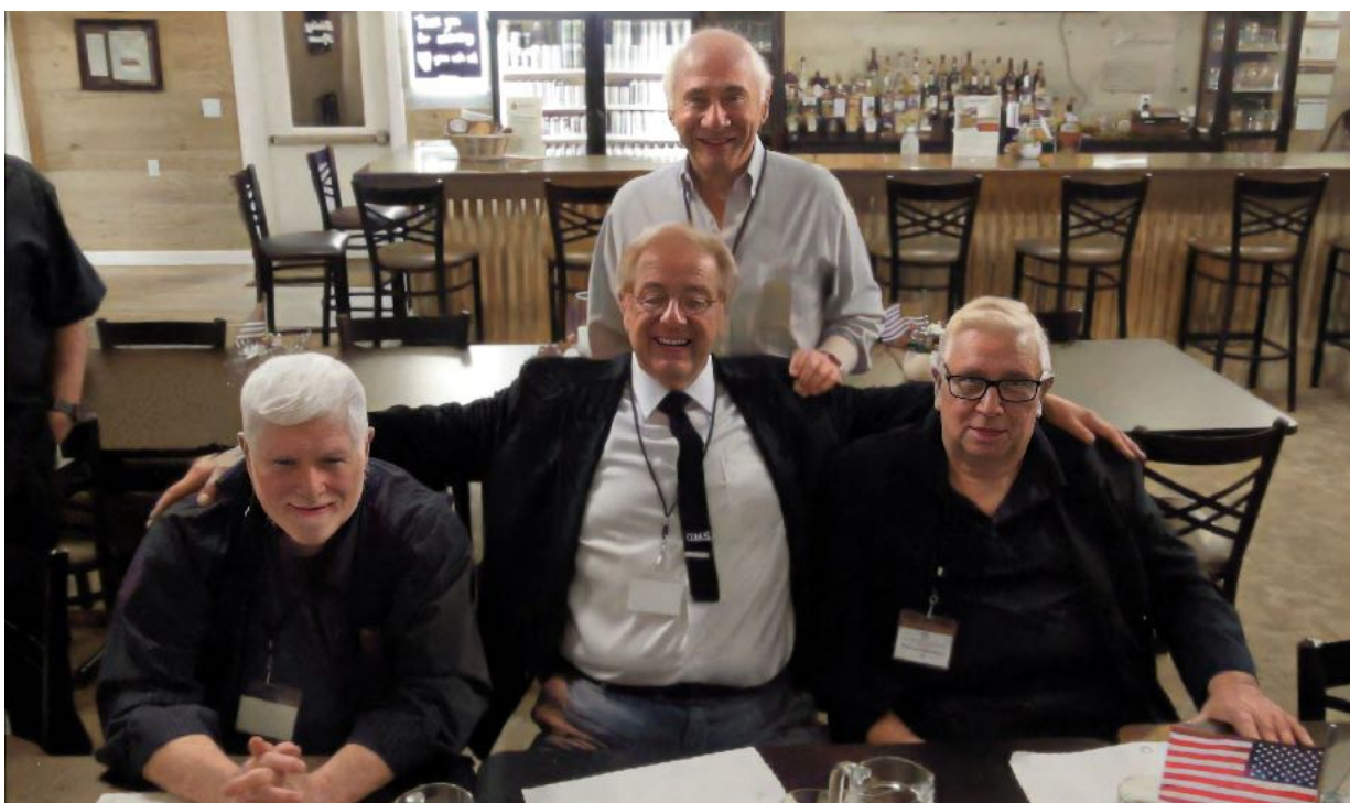
Class of '64 Members